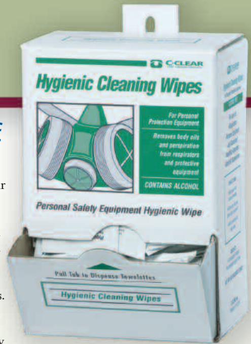
Contains Alcohol 32