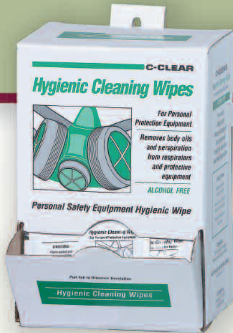
31 Alcohol Free